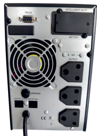
► REAR PANEL